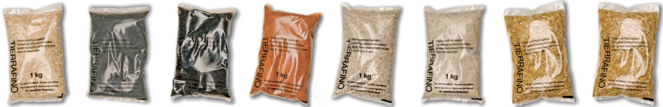
Yellow Sienna Sand 1,2 - 1,8 mm